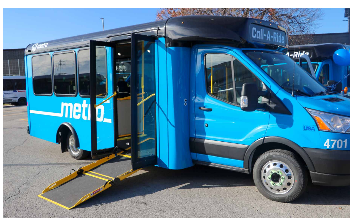
All Metro Call-A-Ride vehicles are equipped with lifts or ramps that can accommodate wheelchairs and other mobility devices

Applications can be obtained by contacting the ADA Services Department at 314-982-1510, Monday – Friday, 8 a.m. – 4:30 p.m., via email at ADAServices@MetroStLouis.org, or on our website at MetroStLouis.org/Accessibility