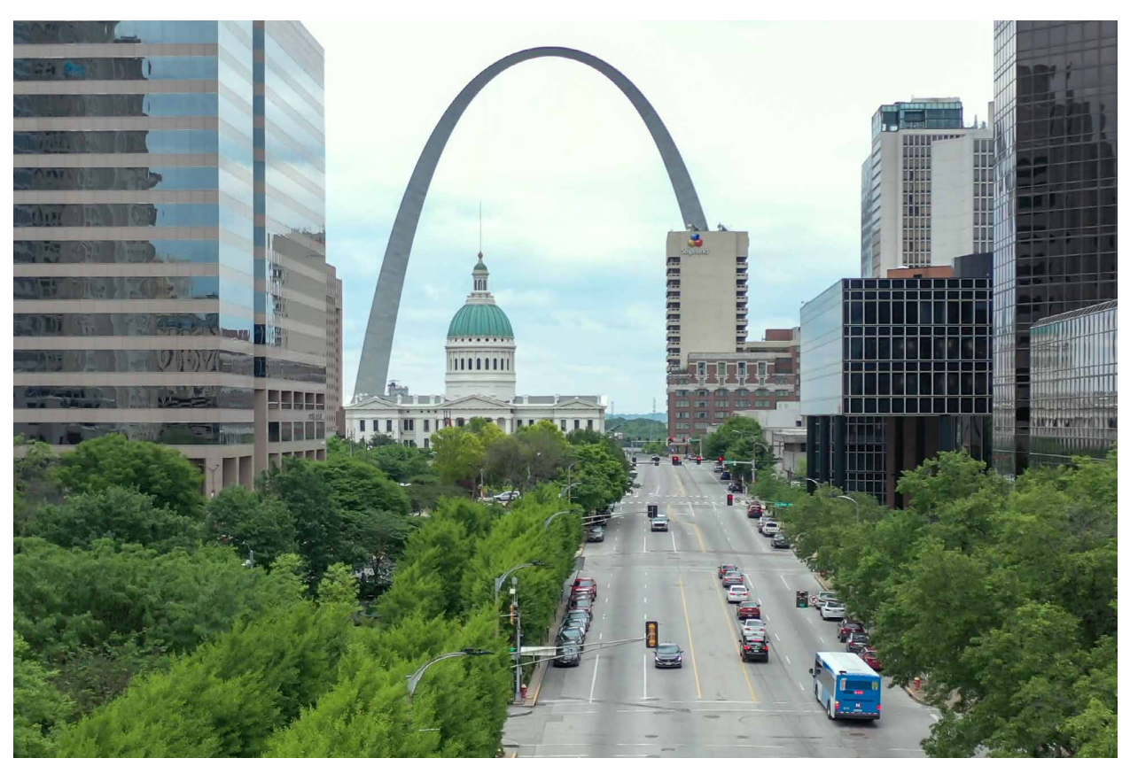
The Gateway Arch in downtown St. Louis is just one of the many destinations you can easily access with MetroLink and MetroBus