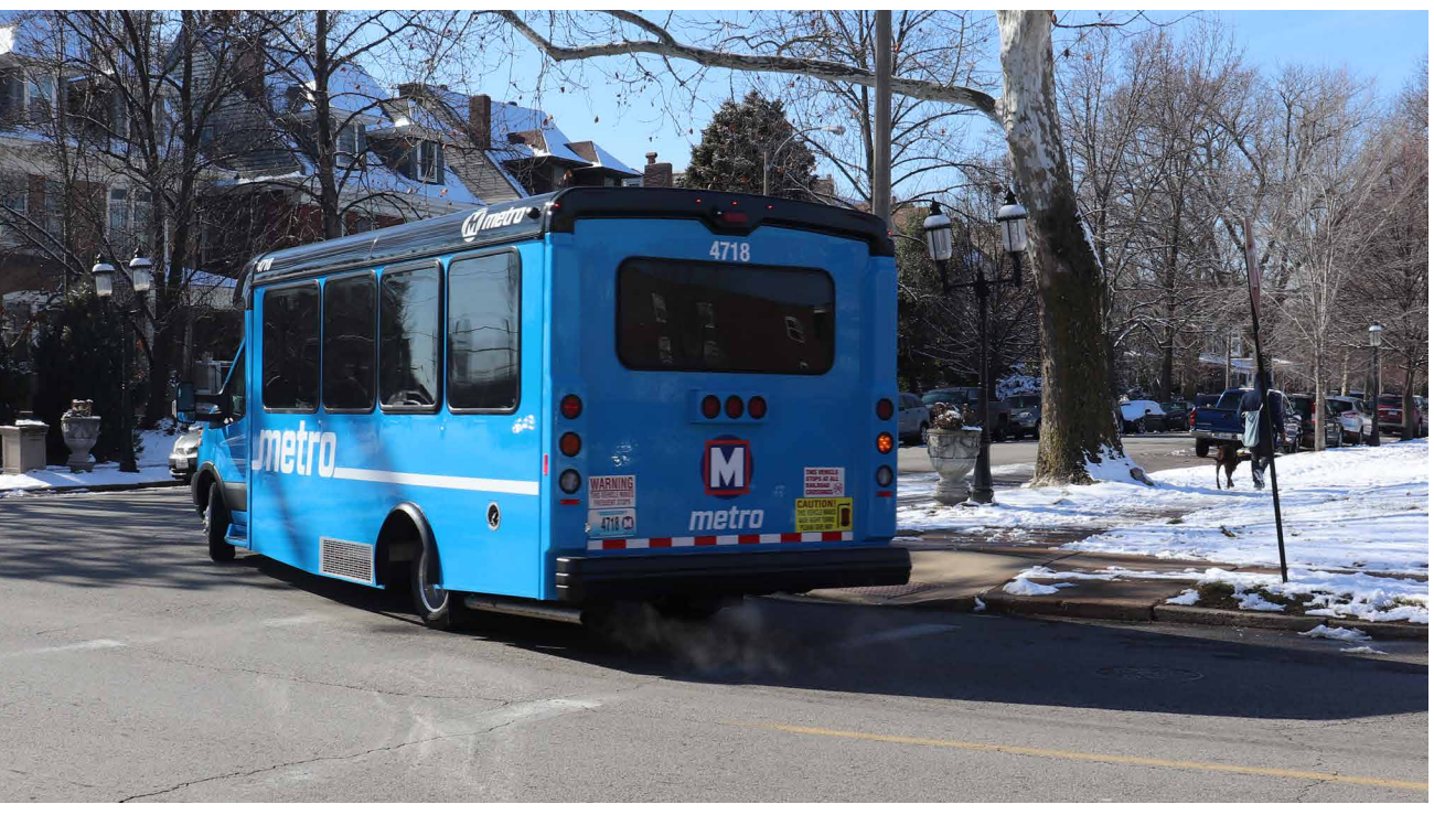
Whether it's rain, shine or snow, I where you need to go

Metro Call-A-Ride typically provides curb-to-curb service. Origin to destination service, which provides assistance from the vehicle to the first exterior door at the rider's pick up and/or drop-off location, is available for those who qualify and request the service at the time of booking. See page 13 for more information about origin to destination services.